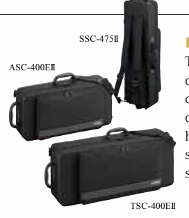
■ Case This lightweight, durable case can be conveniently carried by its handle, shoulder strap, or backpack style straps.