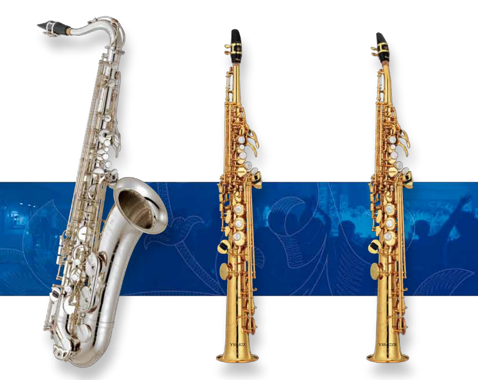
YAS-82Z/YTS-82Z can be ordered without a high F<sup>‡</sup> key for a more efficient response.