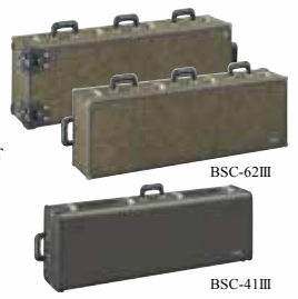
Case This lightweight, durable case can be conveniently carried by its handle, shoulder strap, or backpack style straps.